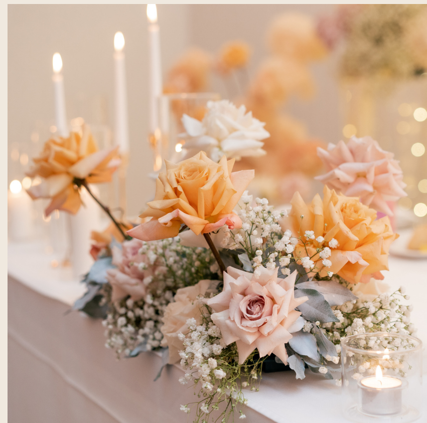
TABLE FLOWER CLOUD

Something a bit more special for the bridal table. A slightly longer version of our standard flower cloud. Created in oasis foam so you can easily see over the arrangement.