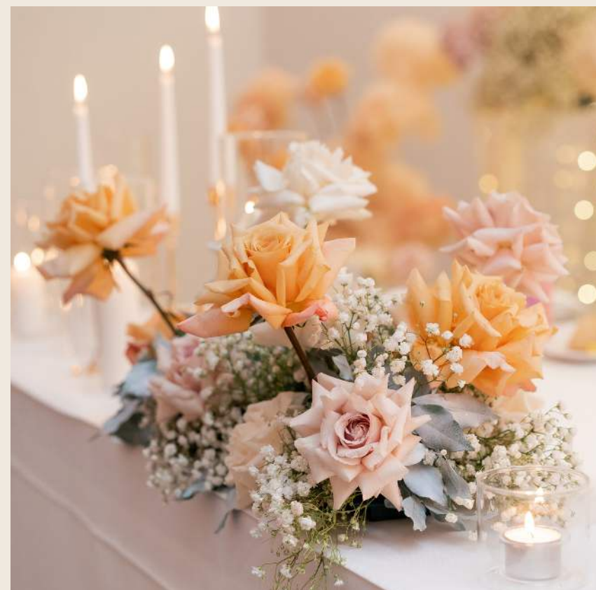
TABLE FLOWER CLOUD

Something a bit more special for the bridal table. A slightly longer version of our standard flower cloud. Created in oasis foam so you can easily see over the arrangement.